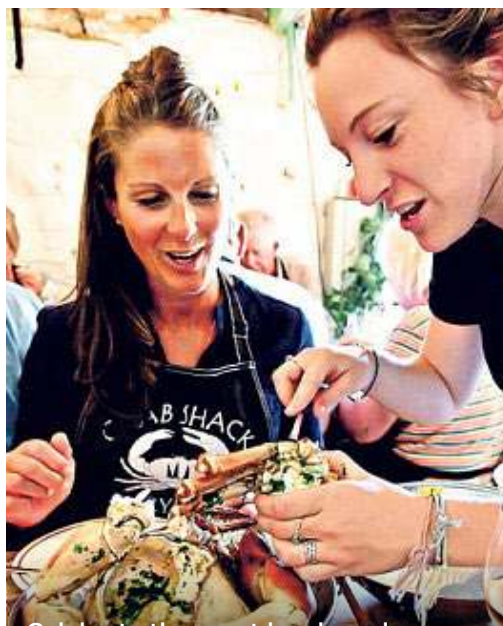
Celebrate the great local produce found on Scilly at the annual Taste of Scilly Festival, it runs throughout the month of September every year.

Scilly has lots to keep you busy whatever time of year you choose to visit. From major sporting events to food and drink festivals, arts events to walking tours, there are a variety of events and adventures to be found in every corner of the five inhabited islands.