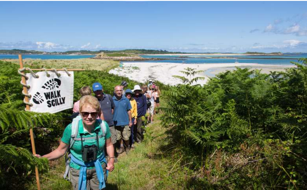
The best way to explore the beautiful islands, both inhabited and deserted, is on foot, and many enjoy doing so during the popular twice-yearly Walk Scilly festivals held in April and October. There's a host of guided walks to join led by local experts.

During Dark Skies week in October join organisers for twinkly stargazing nights under Scilly's amazing, unpolluted dark skies, listen to guest speakers and more.