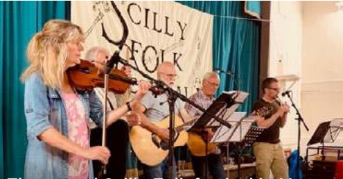
The annual Scilly Folk festival in May offers a programme full of music, song, dance and entertainment.