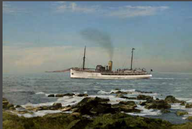
The first purpose built 'Scillonian', launched in 1926. Powered by steam, she could carry 165 tons of cargo and 390 passengers.

In 2020, we, the Isles of Scilly Steamship Group celebrate 100 years of history.